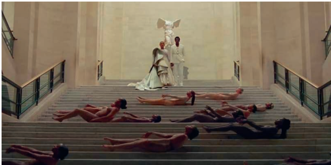
Figure 7 Apeshit . Beyoncé and Jay-Z Carter. 2018.

Last but not least, the Victory of Samothrace has been given a new light in Beyoncé and Jay-Z's latest video clip, "Apeshit", which recounts their success story, as echoed in the lyrics "I can't believe we made it". The Carters privatise the Louvre museum for one night to pose next to several masterpieces of the French museum, including the Mona Lisa, dressed in haute couture. The video clip shows four ancient sculptures: the Great Sphinx of Tanis, the Nike of Samothrace, the Venus de Milo and Hermes Fastening His Sandal, alongside several paintings depicting ancient scenes, like David's Intervention of the Sabine Women . Next to these white and spotless statues, Beyoncé, along with her husband and black backing dancers, makes a political statement about black beauty and black feminism. 8 Indeed, the opposition between black and white skin colours and fabric seems central to the video clip's visual power. In front of the Victory of Samothrace, Beyoncé's frenetic dance contrasts with the statue's inertia, and recalls its first location, as a ship's figurehead. Her white dress, made of multiple light layers, is also close to the statue's himation and recalls the high quality of the sculpted drapery. The dancer's choreography on the stairs also recalls the waves, or the rowers' movement (Fig. 7). This statue wasn't chosen by chance: it embodies the Carter's success story and their desire to make these