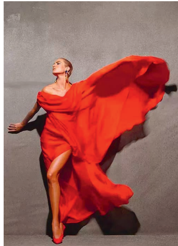
Figure 4 Givenchy Red , Photograph by Victor Skrebneski. 1991, http://www.getty.edu/art/collection/objects/295590/victor-skrebneski-givenchy-red-paris-american-negative-1990-print-about-1995/?dz=0.5000,0.6323,0.44 (last accessed 08/10/2021).