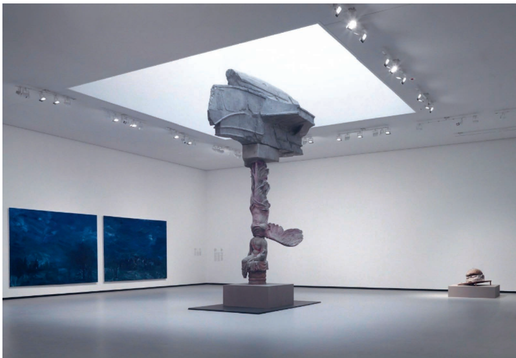
Figure 5 Xu Zhen, Eternity-Winged Victory of Samothrace, Tianlongshan Grottoes Bodhisattva , Fiberglass, steel, cement. 626 × 460 × 230 cm | 246 7/16 × 181 1/8 × 90 9/16 inch. © Courtesy Perrotin. 2013, https://www.perrotin.com/fr/artists/Zhen_Xu/302/eternity-material-winged-victory-of-samothrace-tianlongshan-grottoes-bodhisattva/38589 (last accessed 08/10/2021).

The Nike of Samothrace can also be viewed as part of a larger consideration of western and eastern art and civilisation, as in Xu Zhen's "Eternity", now exhibited in Paris, at the Louis Vuitton foundation (Fig. 5). The artist associated an upside-down Nike, along with the ship's bow, on top of a Bodhisattva's body. 4 Both sculptures are headless. Xu Zhen's career has been rising since he took part in Venice's Biennale in 2001. His series "Eternity" and "Evolution" create culture shocks by mixing icons of western sculpture with eastern and other cultures, such as African masks and Buddhist paintings. As Pascal Bernard mentions in