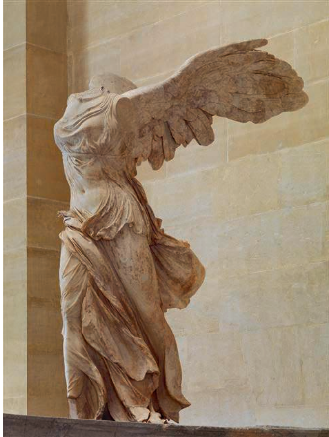
Figure 1 Nike of Samothrace, Photo © Musée du Louvre, Dist. RMN-Grand Palais/Philippe Fuzeau.