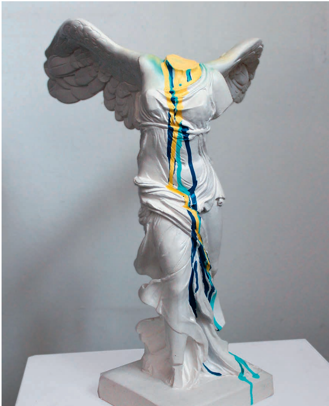
Figure 2 Little Nike , Omar Hassan. Mixed media on plaster sculptures, 60cm. 2017, https://omarhassan.art/albums/sculptures/ (last accessed 08/10/2021).