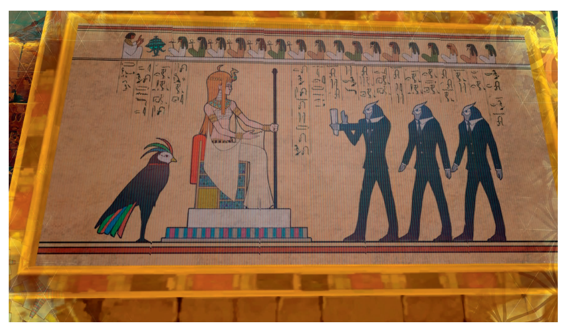
Figure 5 Wall scene in the style of the Book of the Dead (Futaba and anthropomorphic lawyers) ( Persona 5 Royal. PlayStation 4 screenshare. J. Cromwell).

three anthropomorphic figures with bird heads wearing suits, a combination of modern and ancient features. The real-world clothing identifies these three men as lawyers, with the first holding out a roll of paper to Futaba. The rolled form echoes that of papyrus documents, but the narrative context indicates that the contents are entirely modern, referring to the death of her mother. Along the top row of the scene, a series of gods sit, with the seven located above Futaba holding the hieroglyphic sign for life (the ankh), perhaps a subtle marker that Futaba continues to live, while the three anthropomorphic men are associated with death. Together, the scene is highly reminiscent of vignettes found in various copies of the Book of the Dead.<sup>37</sup> Of further note, the signs that accompany these three scenes are taken from the actual hieroglyphic script, rather than being connected with the hieroglyphs found throughout the rest of the palace (discussed below). A cursory look reveals that a small repertoire of signs is repeated in different combinations, creating a suggestion of authenticity without an attempt to create (or replicate) meaningful text.