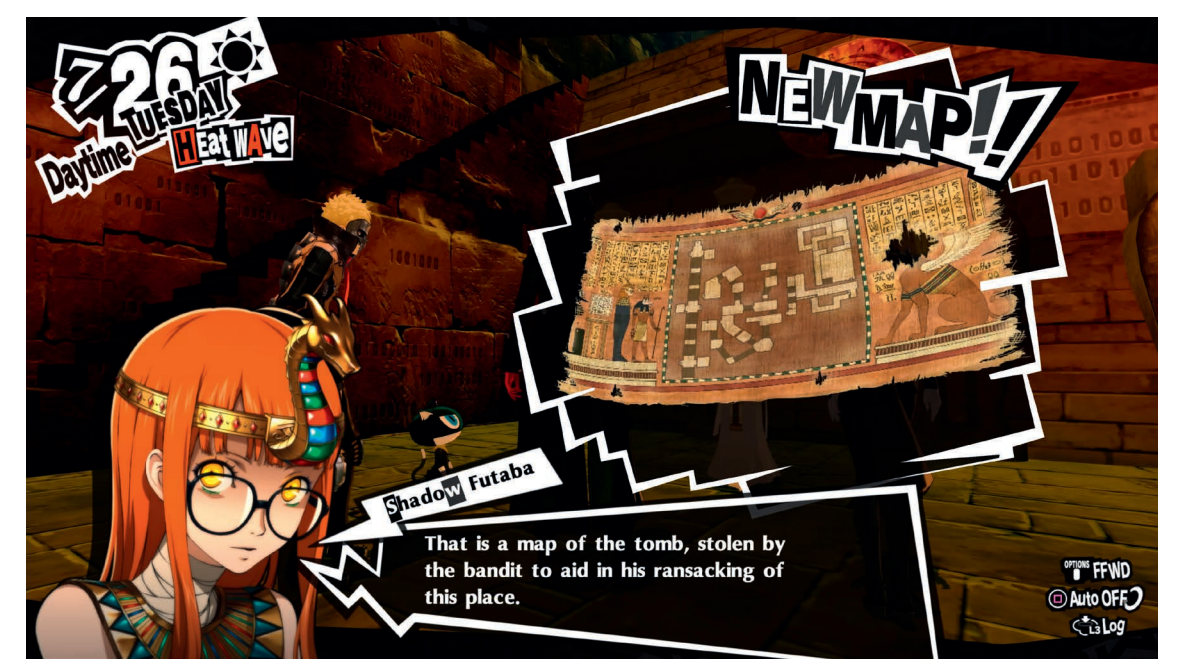
Figure 3 Map of the pyramid, retrieved from the bandit (Persona 5. PlayStation 4 screenshare. J. Cromwell).

sode, when Futaba's cognitive version ('Shadow Futaba') informs the party that a map to the tomb has been stolen, and the party must track down the thief and retrieve it. The party is both the protector of the tomb's artefacts, but also their defiler, depending on whether the game's narrative or the game's mechanics are in question.