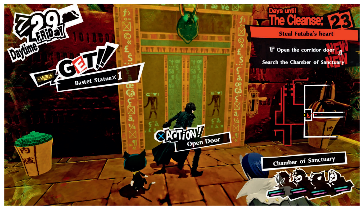
Figure 6 Scene showing the false door with pulsating hieroglyphs and the collection of treasure ( Persona 5 Royal. PlayStation 4 screenshare. J. Cromwell).

Furthermore, the reduction of the script, through removal of phonetic and grammatical content, to recognisable symbols alludes to the idea of universal language. While Persona 5 is set in modern Tokyo, and the use of kanji, hiragana, and katakana scripts in the 'real world' of the game is context appropriate, the use of a universal script within the Metaverse helps further distinguish it from the main setting. Beyond this, the idea of a universal language comprehensible