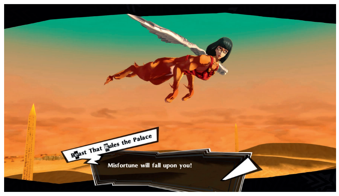
Figure 7 The Wakaba-sphinx ( Persona 5 Royal. PlayStation 4 screenshare. J. Cromwell).

headdress.<sup>53</sup> However, while there is an association with Egypt, the Wakabasphinx instead owes its design to Greek tradition.