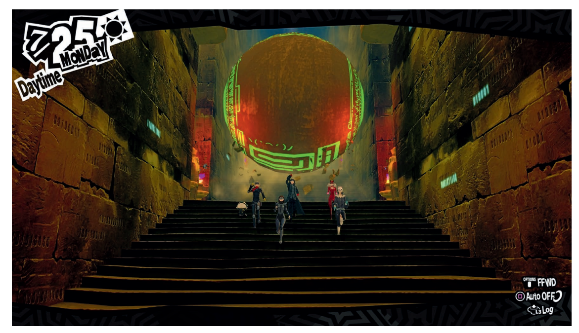
Figure 2 Escaping the boulder trap ( Persona 5 Royal. PlayStation 4 screenshare. J. Cromwell).

The palace's defences move beyond such architectural features and ancient descriptions. Broader pop-cultural motifs are also drawn upon, principally spike traps and rolling boulders that thwart the player's progress. Just as Indiana Jones in Raiders of the Last Ark (1981; dir. Steven Spielberg), the characters outrun the boulder.<sup>24</sup> But, unlike the film, there is never a sense of imminent doom, of being crushed by the boulder, as the action takes place within a cutscene.