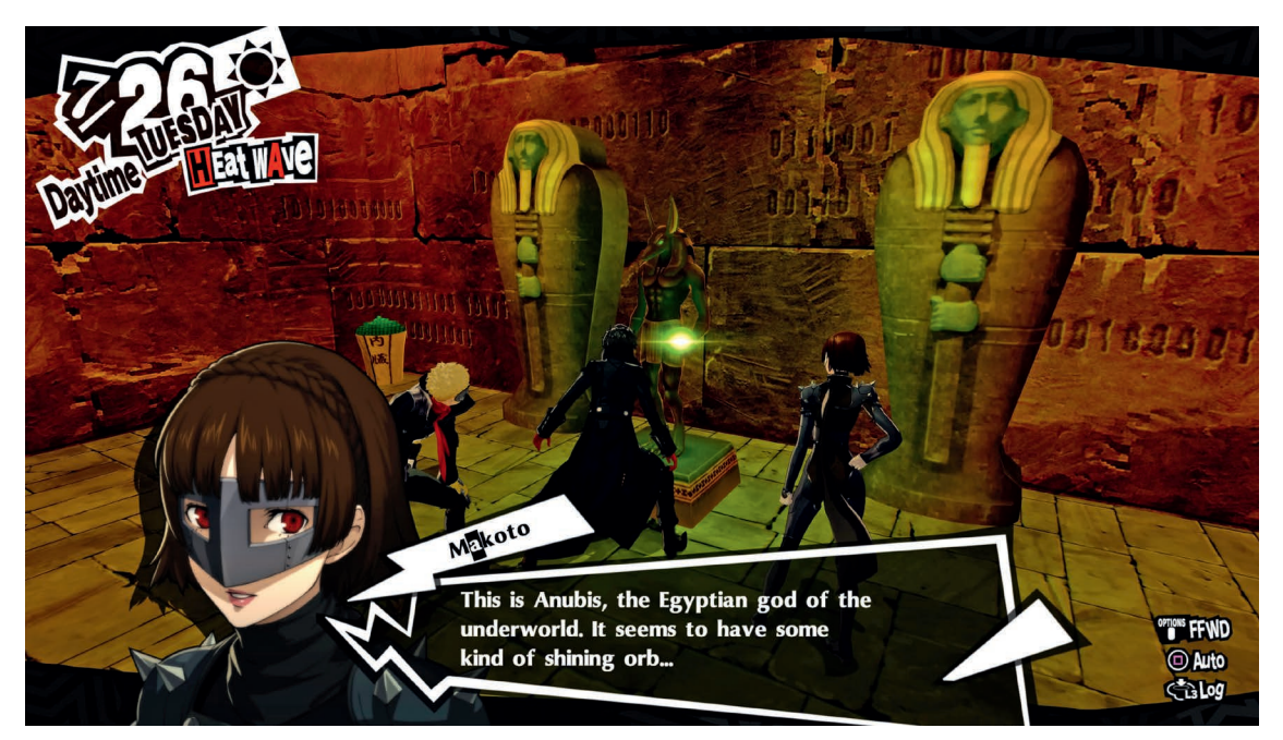
Figure 4 Anubis statue: "the Egyptian god of the underworld" ( Persona 5 Royal. PlayStation 4 screenshare. J. Cromwell).

Additionally, there are special artefacts that form part of the objectives. Anthropomorphic statues of the god Anubis contribute to one mini-puzzle: the god holds an orb in an outstretched hand that the player must remove and transport