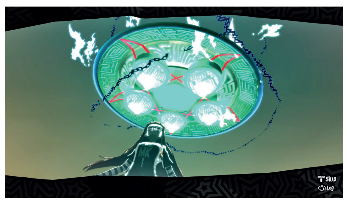
Figure 8 Futaba and the Necronomicon-spaceship ( Persona 5 Royal. PlayStation 4 screenshare. J. Cromwell).

is fitting for Futaba's technological genius, and her awakened self is dressed in a futuristic costume inspired by Tron (1982; dir. Steven Lisberger) – science-fiction stereotypes are set features of her overall presentation. In terms of gameplay, being above the rest of the players also facilitates Futuba's bird's-eye support role. Nevertheless, the inclusion of an alien spacecraft rather than any other flying machine connects the game to such persistent alternative theories.<sup>78</sup>