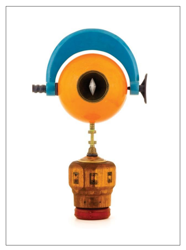
Odysseus Metis. 2010. Mixed Media. 51x30x20cm.

whistle in "Menelaos" reflects his epithet of "master of the war-cry," The C-clamp in "Odysseus" refers to him as "much-suffering/enduring," while "Nestor" (famous as "The Gerenian horseman") incorporates the bit from a horse's reigns. The combination of a name and epithet is of course an important feature of Homeric style, and reflects a broader tendency for 'doubling.' I wanted to include this aspect, but as the epithets were already suggested in the design of the sculptures, instead of repeating them, I opted to provide each sculpture with a word that best reflects the interpretation of the character that informed its production and inclusion in the series. So for example, Odysseus and Achilles were assigned the words 'metis' and 'menis' respectively. The similarity of these words reflect that as the primary heroes of the two epics they function as a pair within the overall series, but the stark difference in the meanings of these words indicates that they form an oppositional pair.