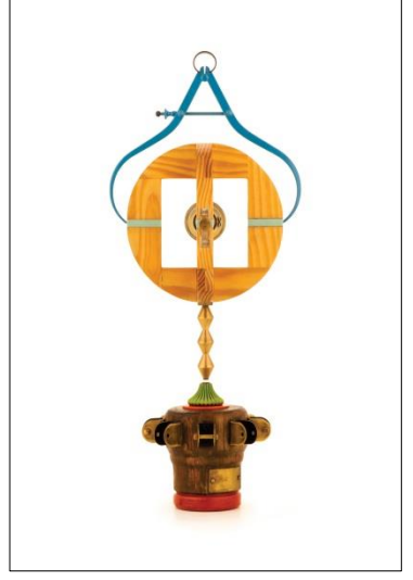
Telemachos Ophello. 2011. Mixed Media. 57.5x34.5x24.5cm.

thets, the etymology of their name, how they are described by the poet and other characters, and their actions and interactions with other characters. Of these, I will make a selection of physical, personal, and behavioural attributes that will best contribute to the formal and thematic aims of the series of sculptures as a whole. The translation of attributes then takes the form of comparing an abstract idea with an object in terms of its form and function. So, for example, my description of Telemachos was premised on an understanding of this character as a hero in the making and a reflection of