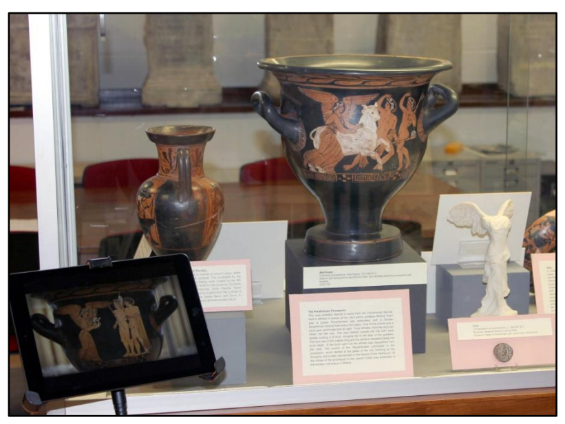
the vase they were made from.

Vase animations on display at the University College Classical Museum alongside