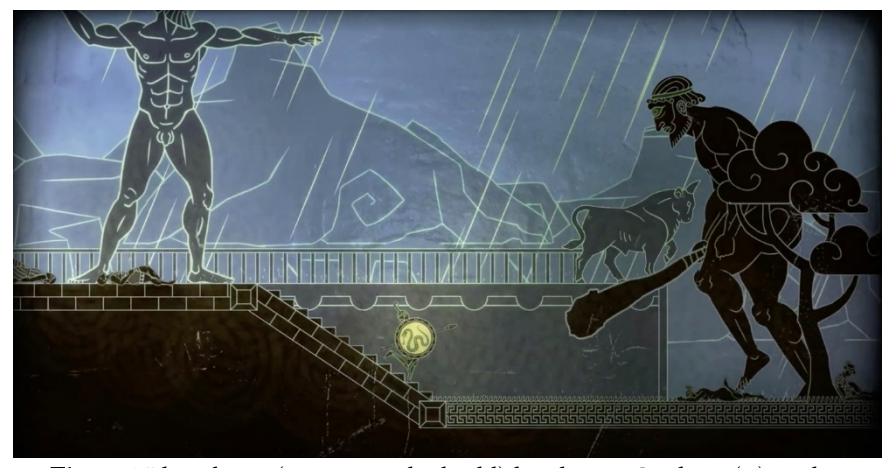
Fig. 1: Nikandreos (centre, with shield) battling a Cyclops (r.) with a statue of Zeus (l.) in the background

All three of them have agreed to provide answers to a written questionnaire and thus to furnish readers with a behind-the-scenes look at the creation of Apotheon . Their answers have been slightly edited for language and clarity.